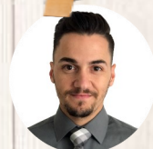
OFFICIAL PHOTOGRAPHER JOSHUA VILLA RIVERSIDE COUNTY